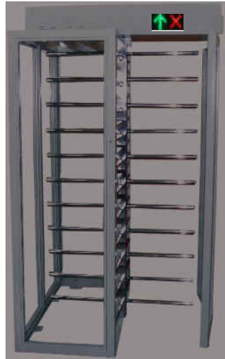
Single lane Clearstyle